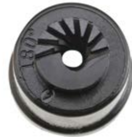
8 jets (180° Option) Perfect for landscape applications for placement on the edge to irrigate garden beds while keeping footpaths dry