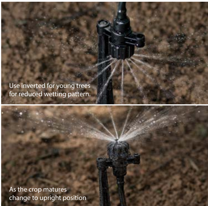
Use inverted for young trees for reduced wetting pattern.